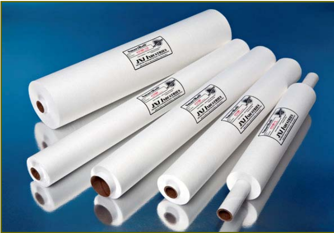
SmartRoll® UnderStencil Wiper Rolls for MPM