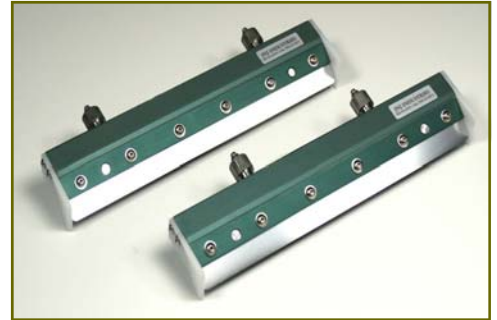
Standard SMH-LF Style

Our "Standard" squeegee holders are gold anodized and our "Lead-Free" squeegee holders are green anodized for ease of visual identification. Lead-Free metal blades are etched with the words "Lead-Free" on the front of the blade.