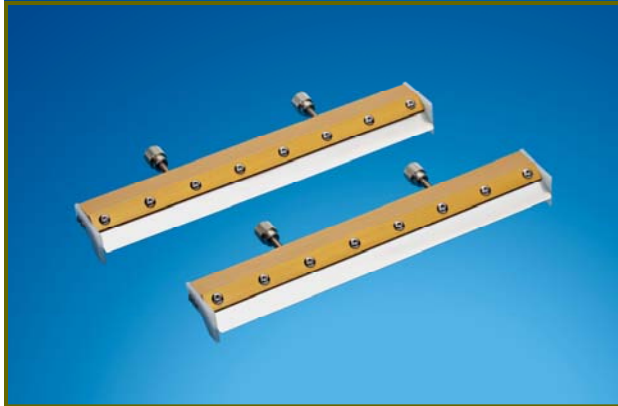
Standard SMH Style

All JNJ Squeegee & Roll Products are Proudly Made in the USA