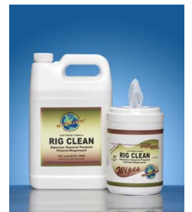
Rig Clean's Dual Action Wipes feature a smooth side for lighter clean-up and a textured side for tougher jobs.