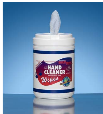
JNJ's Hand Cleaners...effective in the removal of toxic metals from all surfaces, including the skin.