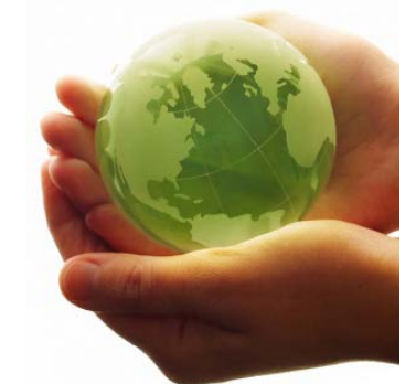
JNJ Industries Supports Living Green

face tension to power away stubborn soils. After washing, most surfaces require only minimal rinsing and will dry with no residue or slippery finish. This environmentally safe formula is water based, non-flammable, with very low VOC's and is safe for use on all water-safe surfaces.