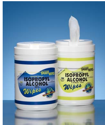
Industrial IPA & IPA/DI universal cleaner and disinfectant 100 wipes per canister