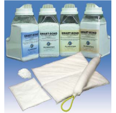
Safely and effectively absorbs liquid hydrocarbons into a solid, manageable waste product. Encapsulates hazardous fluids into non-hazardous solids.

carbon. This vapor suppressing absorbent technology assists to reduce liability through effectively reducing and stabilizing the hydrocarbon generated waste. These factors combined with quick, effective and complete spill control/clean-up and tremendous labor reductions, make Smart-Bond an extremely intelligent, cost effective remediation product.